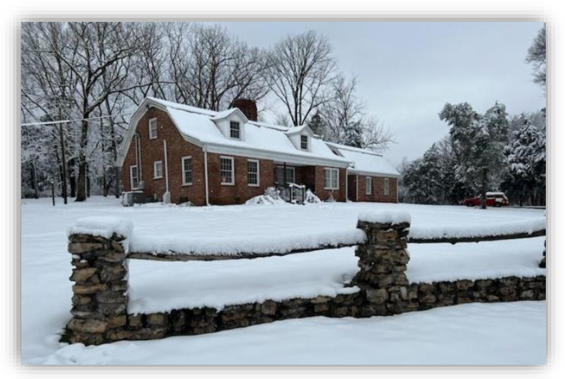
9906 Memorial Pkwy, NW, Huntsville, AL 35810